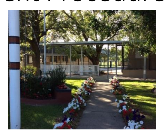
To be reviewed annually.